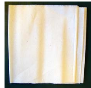
Lint free cloth